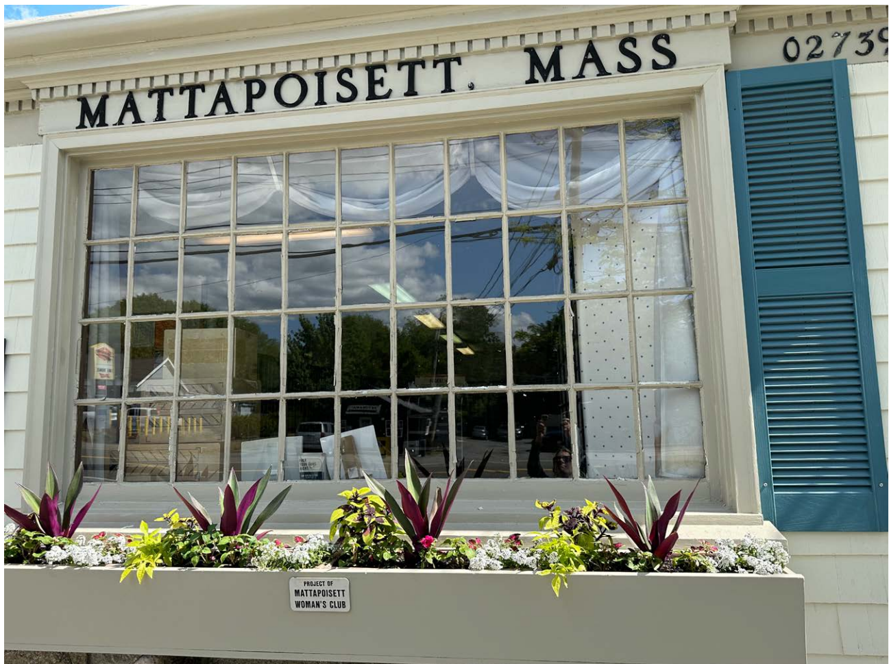
The Garden Group completed the summer plantings and the Post Office looks particularly nice.

Members of the MWC are always welcome to join the Garden Group or visit a meeting. Please contact Cindy Turse for more information - mahina@turse.org