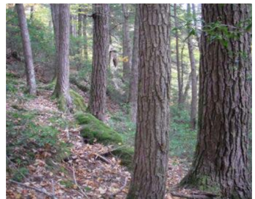
Photograph is a picture of old-growth hemlock from Mohawk trail state forest.