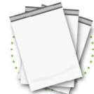
Plastic shipping envelopes