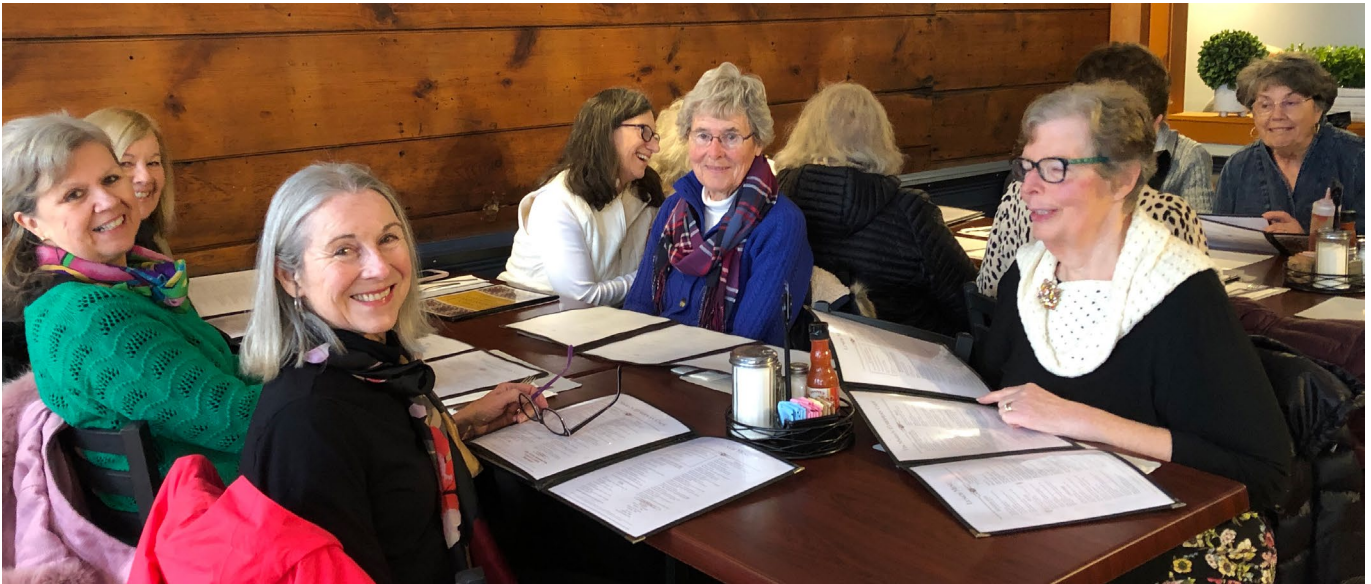
The Garden Group enjoying lunch at Tia Maria's before heading to the New Bedford Whaling Museum.