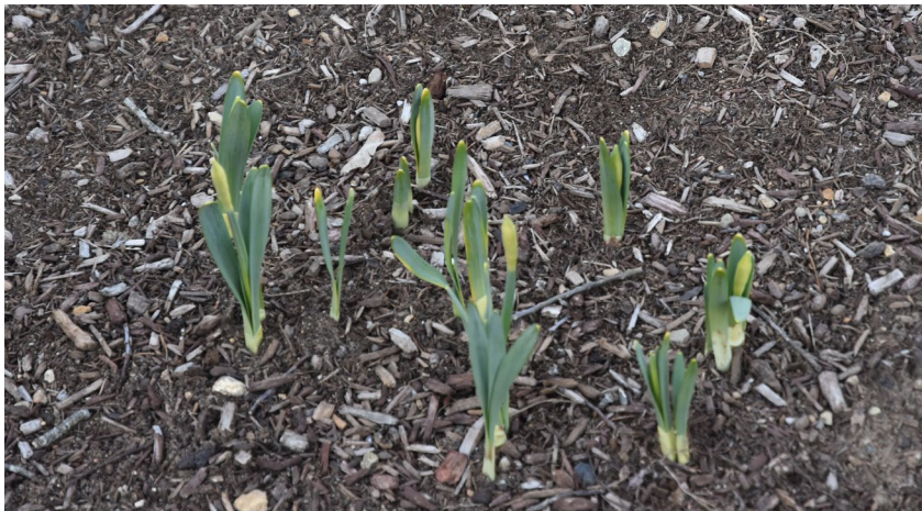
All the hard work last Fall is starting to pay off!