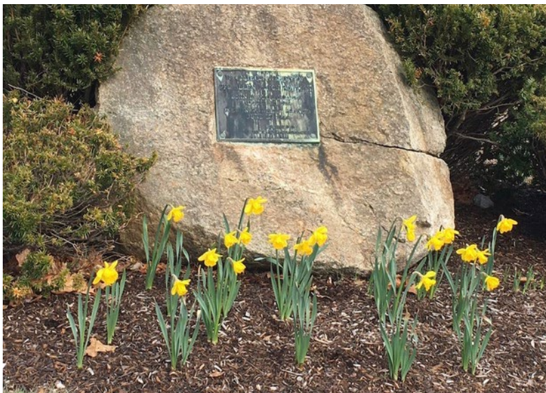
Daffodils at Aucoot Road March 2020