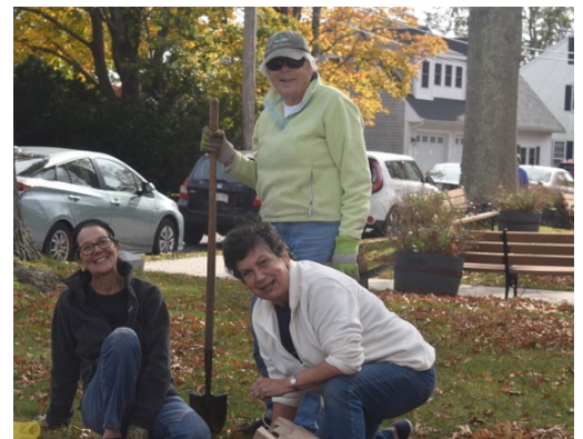
Planting daffodil bulbs at the Mattapoissett Library October 2019