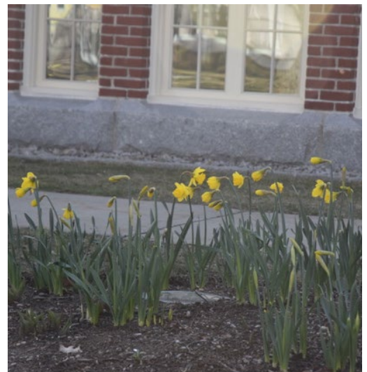
Daffodils at Mattapoissett Library March 2020