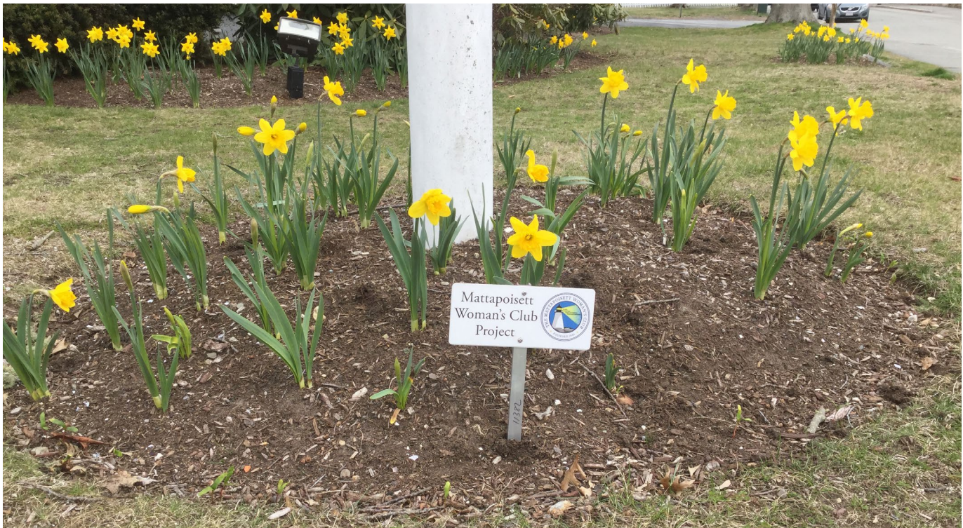
Daffodils in front of the Town Hall.

The signs were made by Village Signs with Jim Bungert attaching the aluminium posts and helping to install them in the ground.