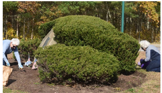
Planting bulbs in Oct 2019 Aucoot Cove